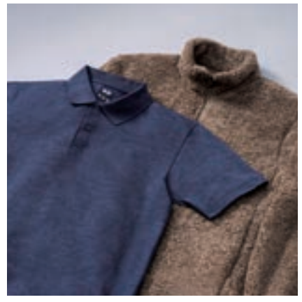
Recycled polyester is partially used in fabrics