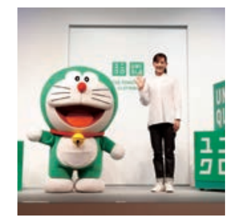
Doraemon Sustainability Mode and Ms. Haruka Ayase (actor) at the announcement ceremony

We proactively communicate to raise public awareness and understanding of sustainability to create opportunities for action-by us and all people. We disclose corporate activities so customers have the transparency they need to purchase products with peace of mind. As part of these efforts, the popular character Doraemon became UNIQLO's global sustainability ambassador in March 2021. In Doraemon Sustainability Mode, Doraemon appears in green, rather than the traditional blue, to symbolize sustainability for the future of the earth. Doraemon is helping UNIQLO spread the message, in an easy-to-understand way, that we can all change the future through the power of clothing.