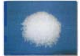
[Nano hybrid capsule2 (NHC2)]

UNIQLO CO., LTD. (Head Office: Yamaguchi City, Yamaguchi Prefecture, President & CEO: Tadashi Yanai) has decided to switch the bags provided to customers to carry their purchases in to a more environment conscious shopping bag. The bag will be introduced from December this year until has been introduced into all of our UNIQLO stores.