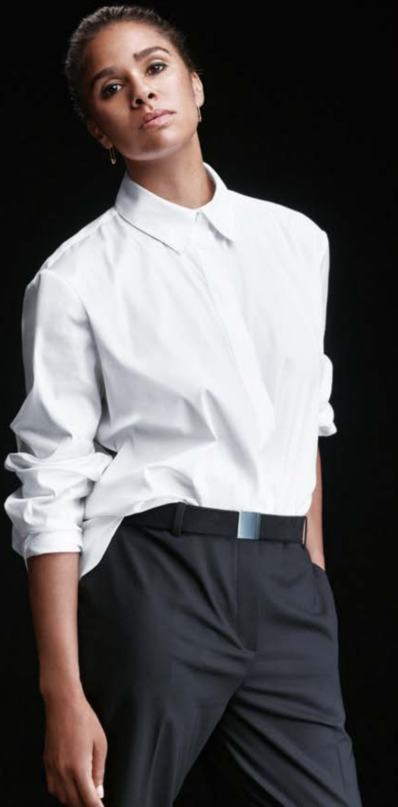
Misty Copeland Ballerina, Philanthropist