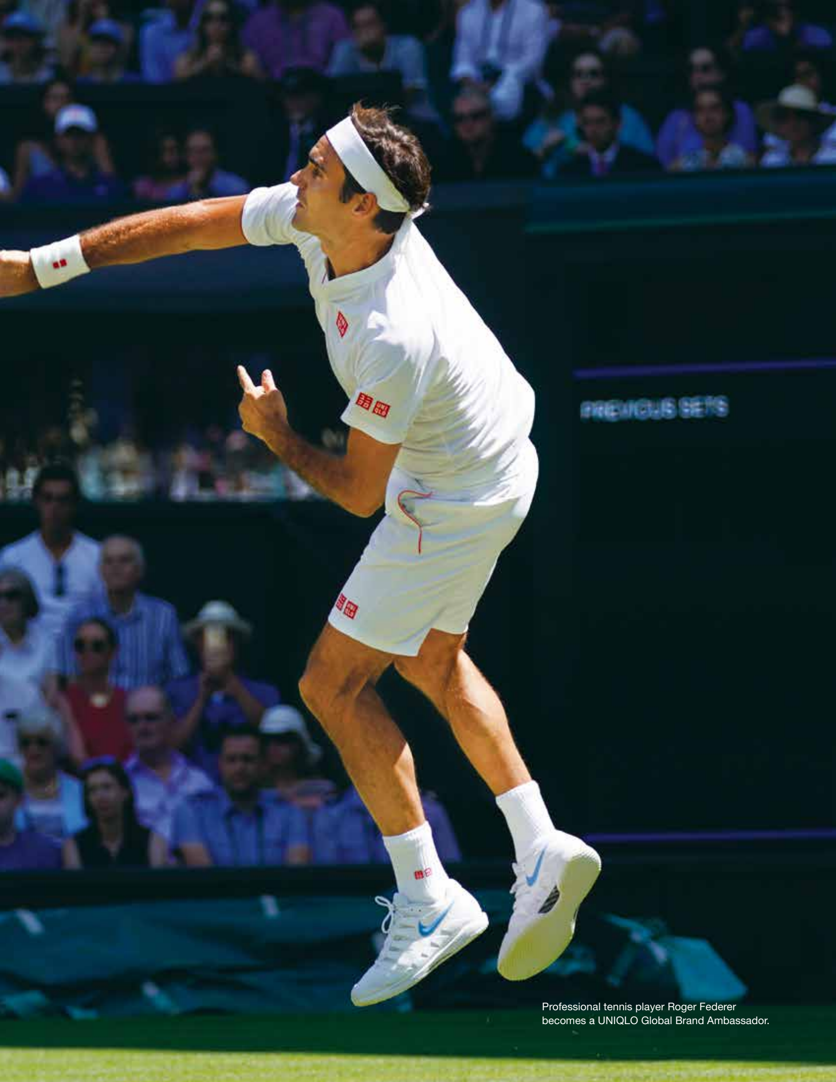
Professional tennis player Roger Federer becomes a UNIQLO Global Brand Ambassador.